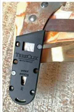
Right side base positioned correctly