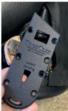
Left side TreeClix base Showing 7 screwholes