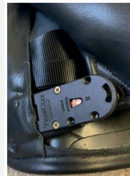
Base neatly placed under gullet lining

Double check whether the left and right base are positioned equally; angle forward/backward and same height.