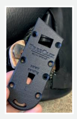
Left side TreeClix base Showing 7 screwholes

The bases need to be fixed on to the points of the tree, the ones marked with an 'L' on the left, and the ones marked with 'R' on the right tree point. The bases have 7 screw holes, to make sure there can always be used 1 screw on either side of the gullet plate, no matter wood, nails or staples. 2 screws in total will do the trick!