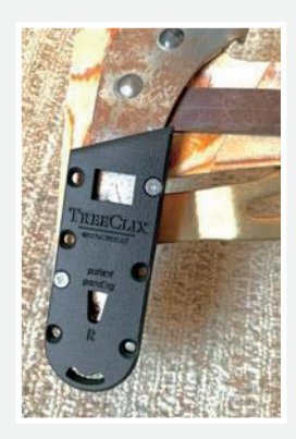
Right side base positioned correctly