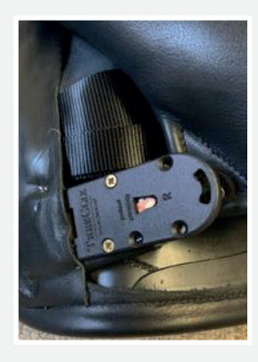
Base neatly placed under gullet lining

Double check whether the left and right base are positioned equally; angle forward/ backward and same height.